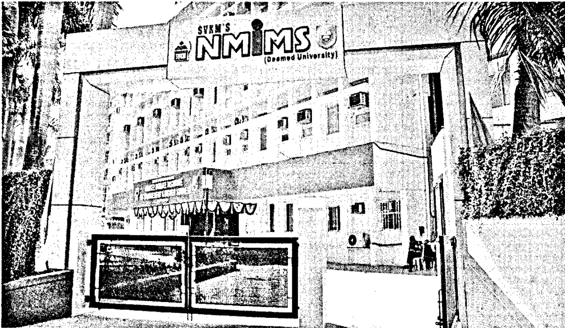
Mumbai-based NMIMS received an A*** grading from Crisil last month